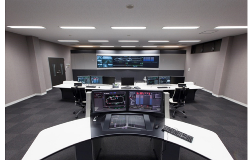
Figure 3 Operational control center