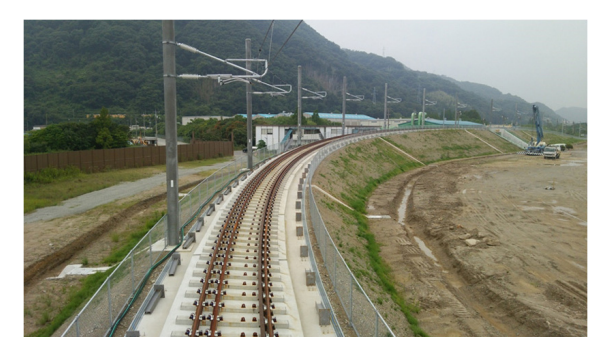
Figure 2 The 50% grade section