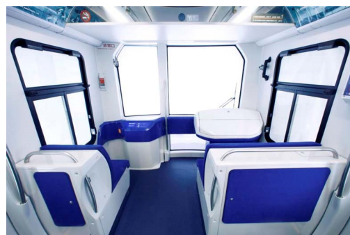
Figure 5 Front part providing a superior view