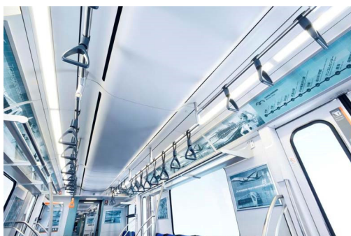
Figure 4 Air conditioning duct