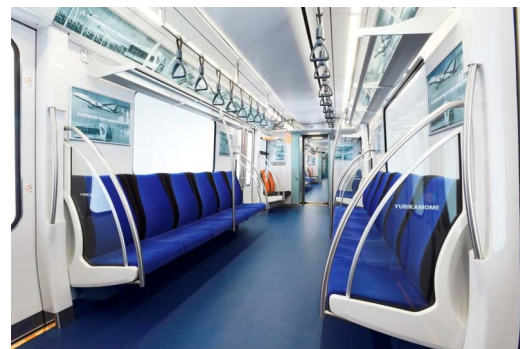
Figure 2 Arrangement of longitudinal seats