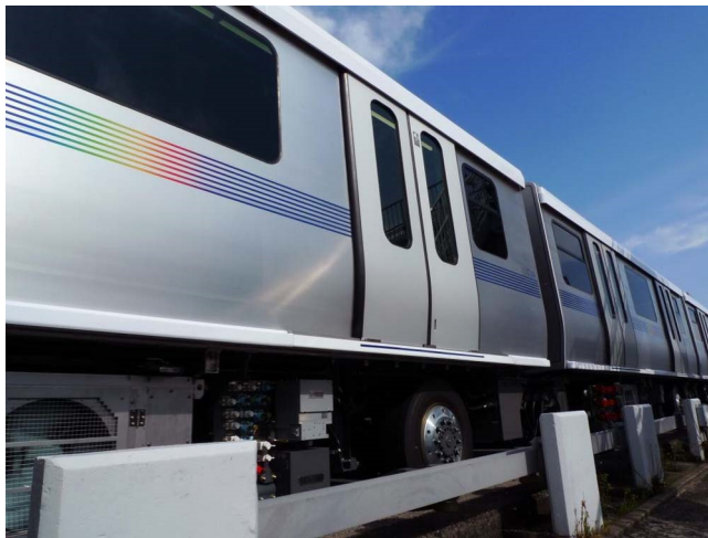
Figure 6 Uncoated aluminum body formed with FSW