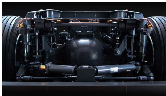
Figure 1 Four-guide-wheel-type bogie