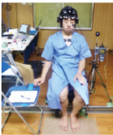
A participant performs mental tasks while being measured under different airflows.