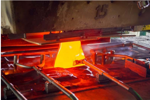
Figure 2 Funnel mold with special shaped Submerged Entry Nozzle

The bow-type casters perform continuous strand bending and unbending, and they are equipped with a straight mold for the casting of steel at thicknesses between 90 mm and 110 mm. Online strand-width adjustments are performed using DynaWidth mold-width adjustment technology. This solution allows the target strand width to be accurately met without the need for an edger ( Figure 2 ).