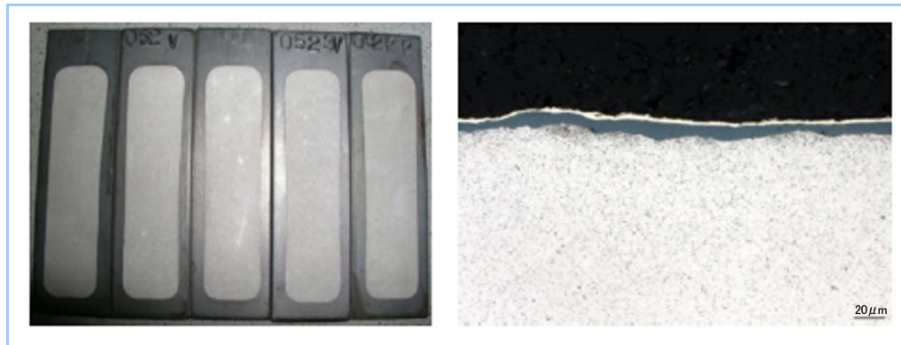
Figure 9 Several samples of pickling tests for variation of etching conditions and a typical micrograph of the scale layer of ESP material.

For testing a variation of pickling conditions was applied to learn about the behavior of ESP material. It was confirmed, that the material is absolutely comparable to conventional material in pickling conditions to be applied to get good results. Acid concentration, temperatures during pickling as well as the specific consumption of acid are not different to other materials ( Figure 9 ).