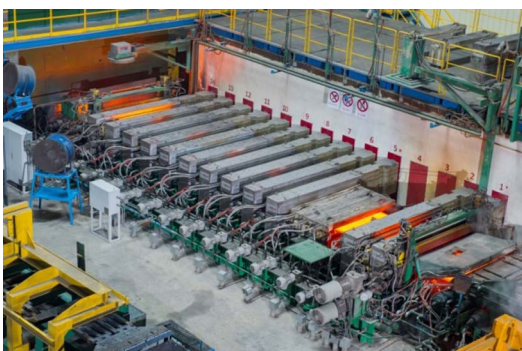
Figure 4 Induction heater

The intermediate strip exiting the high-reduction mill then enters the induction heater, which features a short length of only 10 m. This enables the strip to pass through the furnace in less than 15 seconds, which is decisive for minimum scale formation. Only one descaler – installed immediately before the five-stand finishing mill – is therefore required for the entire line. Unnecessary strip-temperature losses are thus avoided, allowing a more perfect control of the thermo-mechanical rolling parameters ( Figure 4 ).