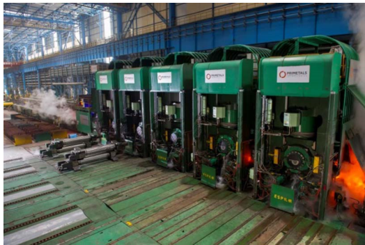
Figure 5 Finishing mill

Following reheating and descaling, the intermediate strip then enters the finishing mill equipped with five 4-high finishing stands. Because strip shaping has already taken place in the high-reduction mill, only the first two finishing stands are equipped with Smart Crown rolls that are designed with a bottle-shaped roll contour. This serves as the basis for final rolling of perfectly flat strip by the last three finishing stands, which are outfitted with conventional work-roll contours. Long-stroke shifting of the work rolls under load, which is regulated by a wear-compensation model, maximizes the service life of the rolls before surface grinding is required. What's more, thanks to the endless mode of operation in Arvedi ESP plants, strip impact on the rolls – typical for batch-operated plants during strip-head threading – is eliminated. This aspect also contributes to a significant extension of the work-roll lifetime. For example, in a typical production sequence comprising 3,000 tons of liquid steel, a total of 170 km of strip – with a considerable portion of 1-mm gauge – is rolled by the final stand ( Figure 5 ).