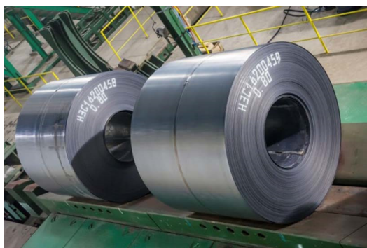
Figure 8 0.8 mm Ultra-thin hot rolled coils

Based on the excellent surface quality of ESP material the direct use of the thin gauge hot rolled strip instead of cold rolled strip is the only logic consequence. This generates savings of energy for cold rolling, annealing and skin passing ( Figure 8 ).