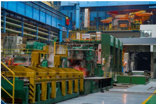
Figure 3 ESP caster directly coupled to high-reduction mill

The casters are equipped with 11 strand segments each, and the metallurgical length of all casters is just over 20 m. Three high-reduction mill stands are installed immediately after the final caster segment in order to utilize the remnant heat energy of casting for the initial rolling step. In addition to major energy-cost savings, this enables perfect crown and wedge control to be achieved with work-roll bending, since the hot core of the cast strand is softer and therefore has a higher formability for shape control ( Figure 3 ).