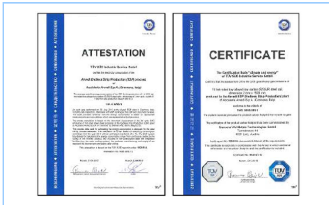
Figure 10 Attestation about energy consumption of the Arvedi ESP process and Certificate PAS 2050:2011 (2012)