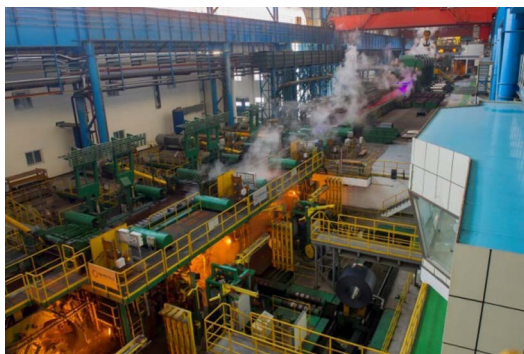
Figure 6 Laminar cooling, high-speed shear and down coilers

Rolling is followed by laminar cooling after which tension-free cutting is carried out by a high-speed shear. The endlessly produced strip with coiled weights of up to 32 tons is distinguished by highly uniform geometrical and mechanical properties throughout its entire length. Because strip-head and -tail cropping is unnecessary with endless production, an average yield of more than 98% is achieved from liquid steel to the coiled product in Arvedi ESP lines. The fully integrated automation system enhanced with an advanced tracking model ensures exact cutting procedures and coil scheduling in accordance with production orders. The entire process, including all plant technology and automation systems, are protected by Arvedi and Primetals Technologies patents ( Figure 6 ).