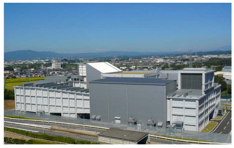
Figure 1 Panoramic view of aero-acoustic wind tunnel

Figure 1 shows a panoramic view of the wind tunnel. Table 1 lists the main components and specifications.