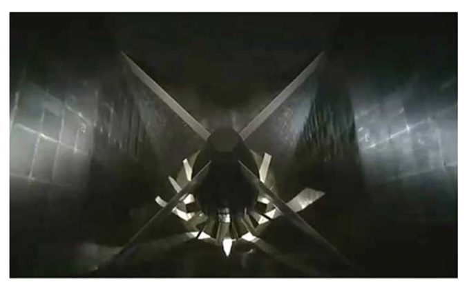
Figure 3 Main fan (downstream side, sound absorbing processing)