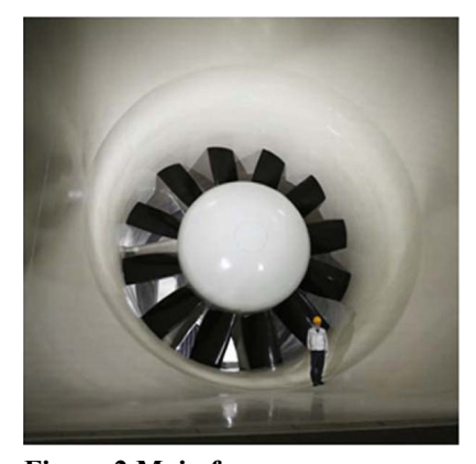
Figure 2 Main fan (upstream side)

The main fan ( Figure 2 ) that generates wind for the wind tunnel consists of a 9-m diameter, twelve-CFRP blades and a motor with an output power of 8.0 MW. Sound absorbing processing ( Figure 3 ) is provided for the wind air-line on the downstream side of the main fan.