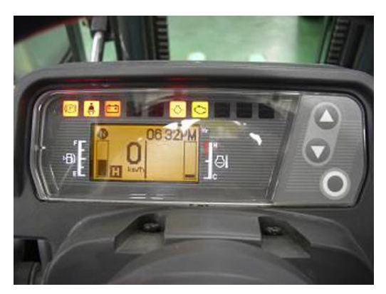
Figure 3 New GRENDiA monitor panel

Figure 3 shows the monitor on the new GRENDiA compared to that of the old model (shown in Figure 4).