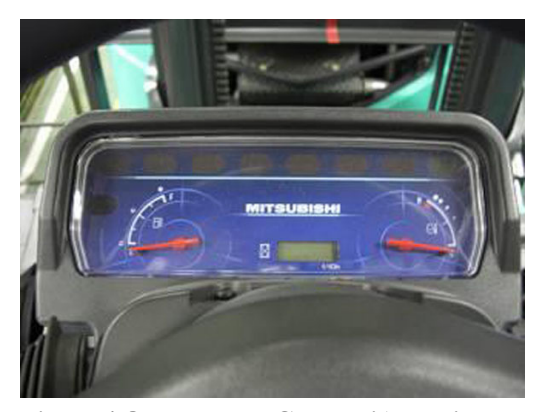
Figure 4 Older-model GRENDiA monitor panel

The digital monitor has the following major functions: