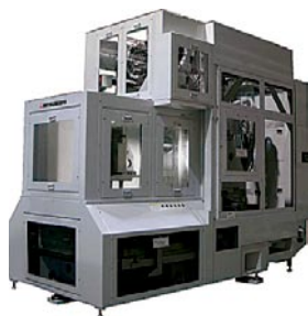
High Productivity Machining Cell (M-CM4B)