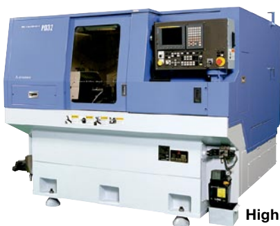
High Production Model PD23