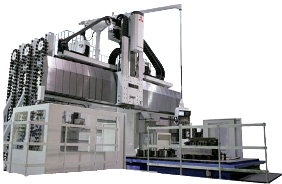
Vertical Precision Milling Machine (MVR33/39DX)