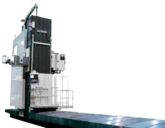
Floor Type Horizontal Boring Mill (MAF-RS150C)