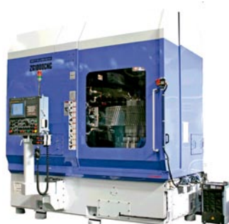
Gear Grinding Machine (ZG1000)