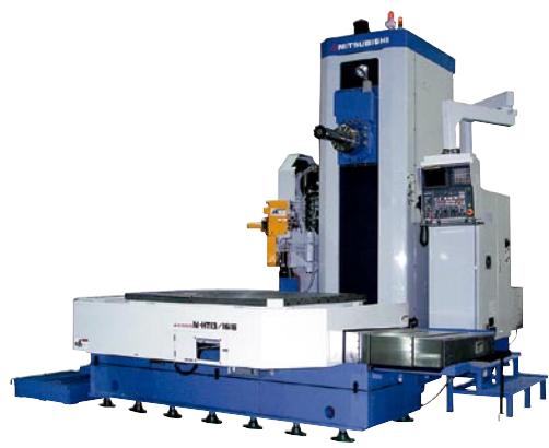
Table Type Horizontal Boring Mill (MHT1618)