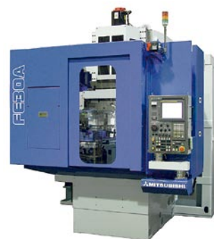
Gear Shaving Machine (FE30A)