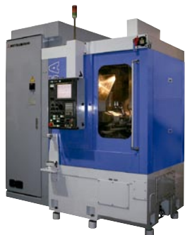
Super Dry Gear Hobbing Machine (GE06A)