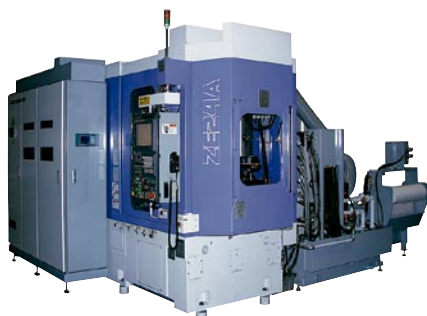
Gear Grinding Machine (ZE24A)