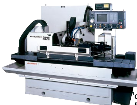
General Purpose Model RD23