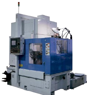
Flexible Guide Type Gear Shaping Machine (ST25)