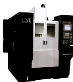
Precision Machine ( \mu V1)