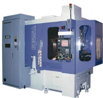
Super Dry Gear Hobbing Machine (GE25A)