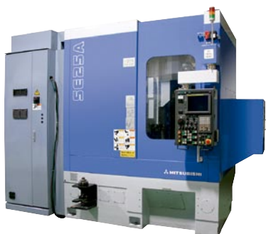
Super Dry Gear Shaping Machine (SE25A)