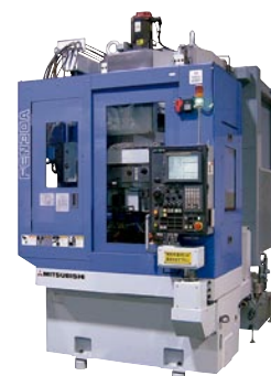
Gear Shaving Machine (Narrow Frontage Type) (FEN30A)