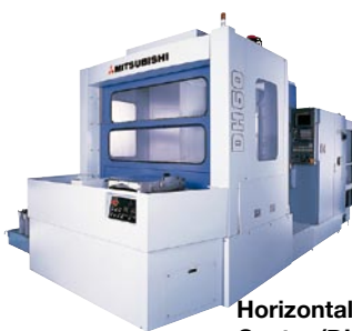
Horizontal Machining Center (DH60)