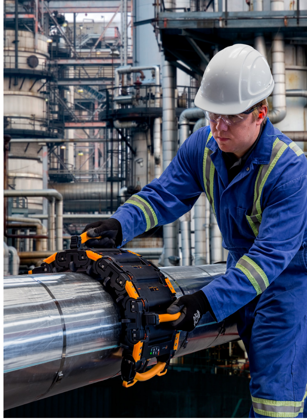
Inspect pipe outer diameters from 152 mm (6 in) up to flat surfaces