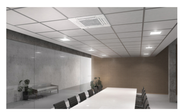
Figure 1 FDTC series appearance

European refined design was adopted through cooperative design with German design company Zweigrad (headquarters in Hamburg). In the pursuit of design properties, it gives a detailed and sophisticated impression, and features a timeless design that is high-class, modern and doesn't make you "feel the era." The panel size of 620 \text{ mm} \times 620 \text{ mm} was selected to fit the grid of system ceilings of various standards. In addition, the panel thickness was reduced to 10 mm so as not to damage the design of the entire ceiling without interference, even if lighting or other equipment is installed in the adjacent space, and the protrusion from the ceiling surface of the system was minimized, making it possible to flatten the entire ceiling surface. A unique honeycomb structure was adopted for the suction grille part, smooth round edges were arranged in appropriate places, and the gap dimensions between the components were unified as much as possible to achieve a functional and stylish design. The louver of the air outlet is designed to have a smooth round shape, and the gap between the louver and the opening is designed to be as inconspicuous as possible when operation is stopped and the louver is closed. This creates an even flatter impression as shown in Figure 1.