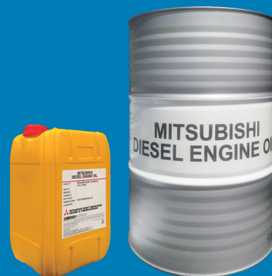
Category: CH-4 15W-40