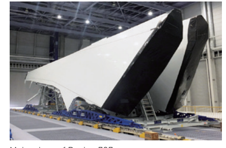
Main wings of Boeing 787

The passenger demand for commercial aviation, which had declined sharply due to the impact of the COVID-19 pandemic, is expected to recover to pre-pandemic levels around 2024. From there, both the movement of people and economic growth are projected to roughly double around 2040.