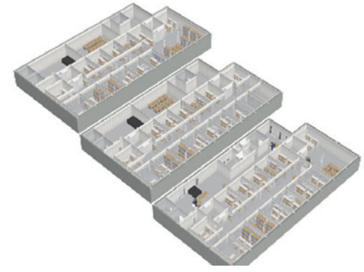
In-warehouse simulation through 3D modeling

In Logistics, Thermal and Drive Systems, we are contributing heavily to the development of Smart Infrastructure leveraging DX. The key to digital solutions in this domain is the \Sigma \mbox{SynX} (Sigma SynX), a digital platform that consolidates our advanced control technologies. By providing onestop solutions for reductions in labor, as well as optimization and high reliability, we are already advancing initiatives that answer customers' diverse needs.