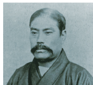
Yataro Iwasaki, MHI's first president

Today, as a global leader in monozukuri and engineering, MHI Group utilizes its advanced technology to provide integrated solutions in a wide range of fields, from infrastructure such as shipbuilding, transportation systems, commercial aircraft, and power systems, to space systems. Our activities have also expanded worldwide. MHI Group aims to contribute to progress of society more broadly by solving complex global issues, such as rapid urbanization in emerging countries, infrastructure upgrades in developed countries and environmental issues including climate change.