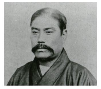
Yataro Iwasaki, MHI's first president

Today, as a global leader in monozukuri and engineering, MHI Group utilizes its advanced technology to provide integrated solutions in a wide range of fields, from infrastructure such as shipbuilding, transportation systems, commercial aircraft, and power systems, to space systems. Our activities have also expanded worldwide. MHI Group aims to contribute to progress of society more broadly by solving complex global issues, such as rapid urbanization in emerging countries, infrastructure upgrades in developed countries and environmental issues including climate change.