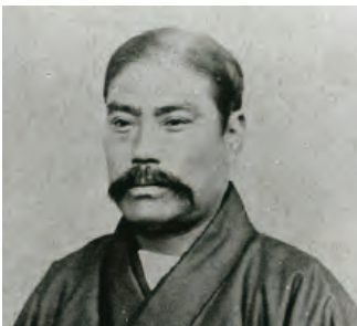
Yataro Iwasaki, MHI's first president

Today, as a global leader in monozukuri and engineering, MHI Group utilizes its advanced technology to provide integrated solutions in a wide range of fields, from infrastructure such as shipbuilding, transportation systems, commercial aircraft, and power systems, to space systems. Our activities have also expanded worldwide. MHI Group aims to contribute to progress of society more broadly by solving complex global issues, such as rapid urbanization in emerging countries, infrastructure upgrades in developed countries and environmental issues including climate change.