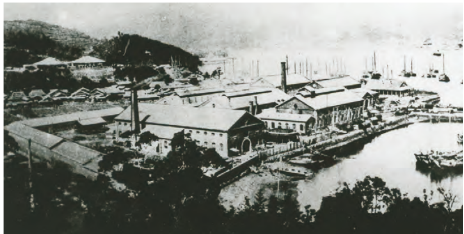
Nagasaki Shipyard & Machinery Works in 1885