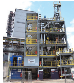
The HYFOR pilot plant in Leoben, Austria

Hydrogen-based Fine-Ore Reduction (HYFOR), which MHI Group member Primetals Technologies has developed, is the world's first direct reduction process for iron ore ultra-fines that do not require any material preprocessing like sintering or pelletizing and is capable of operations with 100% hydrogen as a process gas. HYFOR provides a nearly zero-carbon production process and can effectively replace the blast furnace. For producers, this alleviates concerns surrounding carbon taxes and controls production costs stemming from emissions trading systems (ETS).