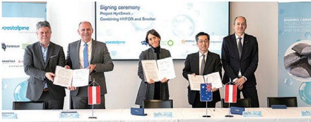
Signing ceremony between the four companies involved

With an increased focus on decarbonization worldwide, steel producers across the globe are searching for breakthrough technologies to reduce carbon emissions and transform their production processes. Currently, the conventional blast furnace route is the most prominent means of steel production. However, the blast furnace for iron ore reduction is the most carbon-intensive part of this process; finding ways to improve this process is thus key to decarbonizing the steel industry.