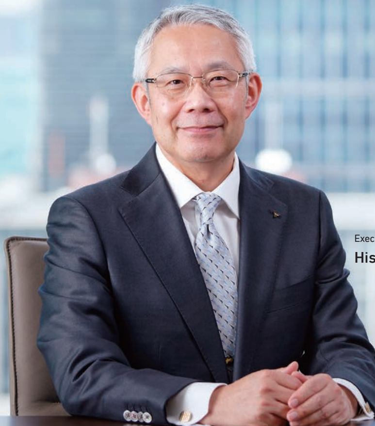
Executive Vice President, CFO

We will raise corporate value while maintaining dialogue with shareholders and investors