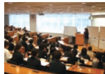
Managerial training for women