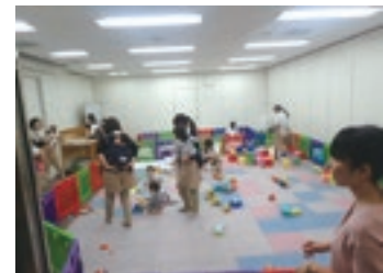
Panel discussion with employees on childcare leave