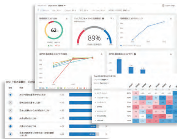
Sample screenshots of pulse survey system to be deployed globally

We will continue to reform our HR processes by adopting the latest technologies on an ongoing basis.