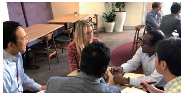
MHI Leadership Program session in Australia (Nov. 2019)

Through steady repetition of such a development cycle, we strive to cultivate next-generation executives capable of succeeding in any environment.