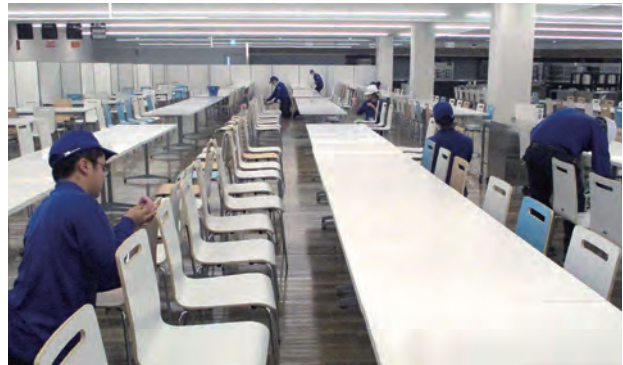
Cleaning crew at work in canteen

We employ individuals with accessibility needs throughout Japan and globally. We aim to create workplace environments where even people with challenges can comfortably play active roles. As one component of this program, we are proactively expanding job opportunities for them. In 2021, we newly launched on-site grounds-keeping operations in two workplaces in Japan to create new jobs. We will continue to maintain and expand workplace environments where individuals with accessibility needs can work to their hearts' content and give full play to their respective capabilities.