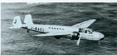
The Nippon, which made a successful round-the-world goodwill flight