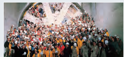
Opening ceremony for the total station construction portion of the Channel Tunnel under the Strait of Dover