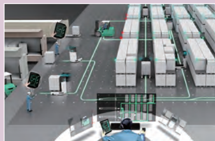
Σ SynX-powered AGF