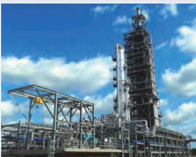
CO 2 capture plant