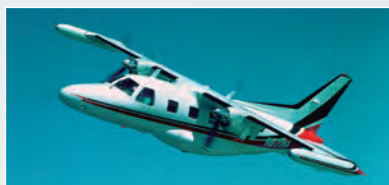
The first MU-2A multi-purpose light aircraft