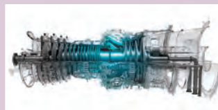
Hydrogen co-firing/100% hydrogen firing gas turbine