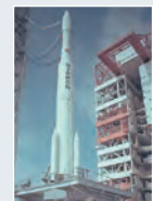
The first N-1 rocket