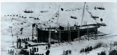
Nagasaki Shipyard & Machinery Works' first steel steamship, the Yugaomaru

Progressing along with Japan's modernization