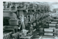
Rolling plant for steelworks

Playing a part in a technology-based nation