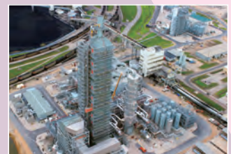
CCS/CCUS (Carbon capture and its effective utilization)