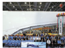
Ceremony to commemorate shipment of composite-material wing box for the 100th Boeing 787

U.S. firm, Federal Broach Holdings, acquired given its strongly complementary products and market with MHI. Together with MHI's cutting tool manufacturing and marketing base in India, leads to creation of three global bases.