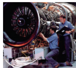
Pratt & Whitney's aero-derivative gas turbine

MHI Compressor International Corporation (MCO-I), a marketing and service company in the U.S., established by MHI subsidiary, Mitsubishi Heavy Industries Compressor Corporation (MCO). For details, see p. 40.