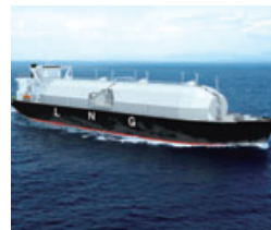
New-generation LNG carrier "Sayaendo"