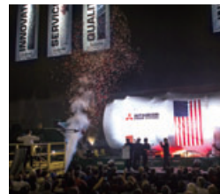
Ceremony at Savannah Machinery Works to mark shipment of first gas turbine

Production increased for composite-material wing boxes used in Boeing 787s. Effort focused on development of the MRJ regional jet. For details, see pp. 41-42.